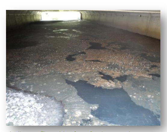
Indicator: Floatables from food processing

A large grease spill from a food production operation was not properly contained, resulting in an illicit discharge to the creek. The waste produced a musty odor, gray water, and a thick buildup on the water surface.