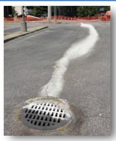
Indicator: Deposits from concrete washout

Stains or deposits can be any color, but it will be different than the outfall. Sediment is a common deposit. Gray-white deposits (see photo) can be from illegal concrete washouts or construction sites. Crystalline powder can be from salt spills or storage areas, as well as from fertilizer discharges.