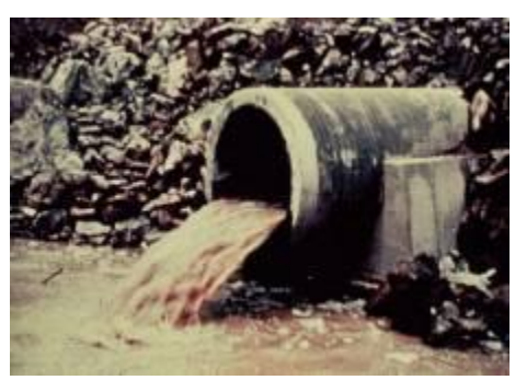
Illicit discharge example - Sediment laden runoff

Illicit discharges can contaminate water supplies, disrupt recreational activities on our rivers and lakes, and harm the environment and aquatic species. It's important to find illicit discharges and eliminate them in order to protect our natural resources and preserve them for future generations.