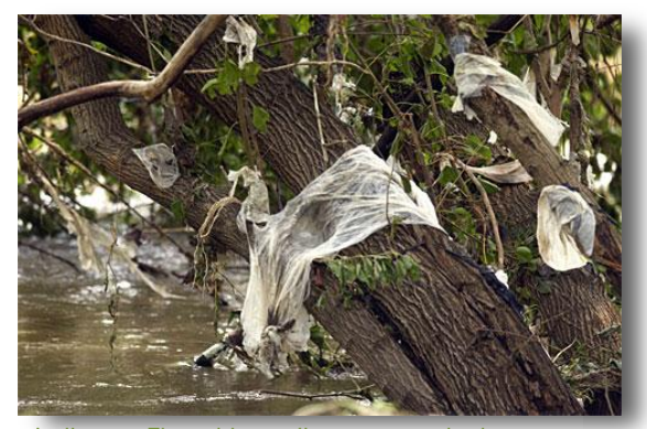
Indicator: Floatables; toilet paper and other trash in tree; indicates sanitary discharges to drainage system.

include: solids or liquids from industrial or sanitary wastewater, garbage, trash, litter, toilet paper, oily sheen (described in detail below), or foam/suds. Natural floatables, such as branches or leaves, are not considered illicit discharge.