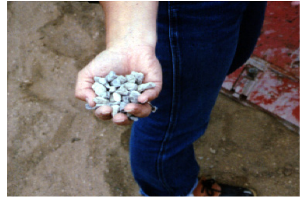
Bentonite material used for well plugging.

Wells must be sealed at or above the ground surface with a welded, threaded, or mechanically attached watertight cap. The Division of Water recommends that the well also be completely filled with impervious grouting material as specified in 312 IAC 13. A well that poses a hazard to human health must be plugged with impervious grouting material.